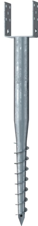
KSF U 60x730-111