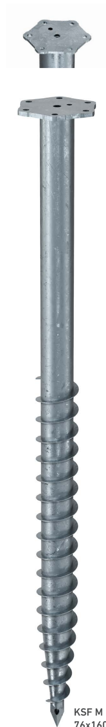
KSF M 76x1600-M16