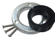
Excenter Set-E60 Item No. 24817