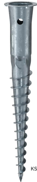
KSF E 89x800-E60